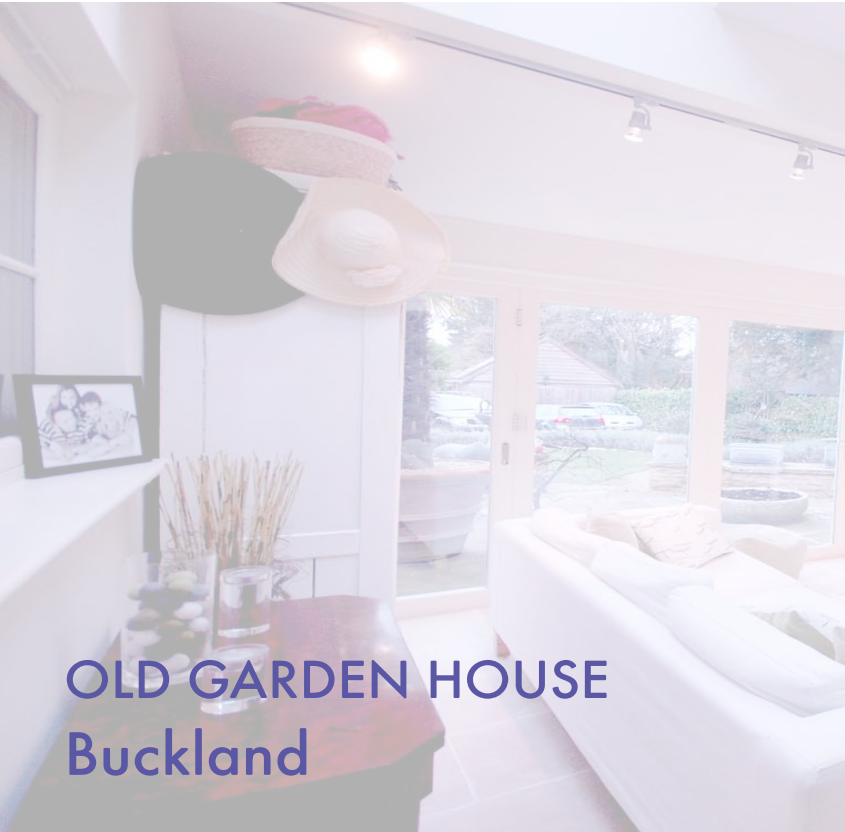
OLD GARDEN HOUSE Buckland